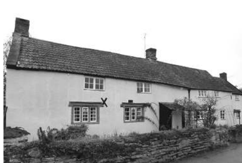
Fig. 1 Curry Mallet, Colliers & Collier’s Cottage

Plan: five rooms in line with a single storey lean-to along the entire rear (north) wall. The earliest elements are an inner room separated from the hall by a post and daub partition that supports a jettied floor within the hall. In line with the jetty beam is the residual foot of a true cruck recently