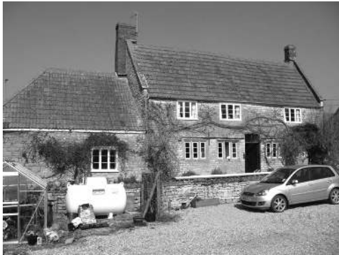
Fig. 10 Adber, Batson's Farm

N wing was constructed with ground floor as buttery/cellar and rooms above. Attic areas were fenestrated for use as servant accommodation. Mid 17th-century a cheese room (accessed via the redundant curing chamber) with cheese loft over was built as an in-line extension; parts of the N wing now being used as a dairy or cider cellar. In the 19th-century the cheese room and loft were converted to domestic use.