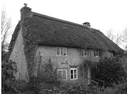
Fig. 4 Longburton (Dorset), Well Cottage

truss with former trenched-purlins, two fireplaces with slightly cambered timber lintels and 4 -5 cm chamfers, the beams (6 - 8cm chamfers with run-out and/or shallow step and run out stops) and the 68-75cm thick rubble-stone walls under a thatched roof indicate an early 16th-century date. (Fig. 4) In the mid 19th-century the walls and roof were raised and the north end room and additional windows inserted creating accommodation for two households.