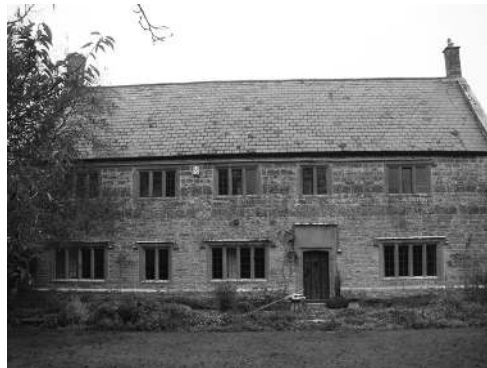
Fig. 12 Trent, The Old School House

The property was built in 1678 (a £1000 endowment in the will of a John Young of Trent to provide education for 20 sons of the poor of Trent with an additional capacity for 20 private scholars).