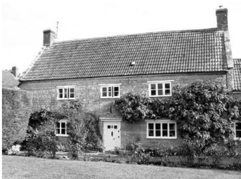
Fig. 7 North Cadbury, Brook Cottage, ritual mark on hall fireplace

Original plan: three unit (hall, central entry & unheated service room, kitchen) with gable stacks, rising to two storeys with attics. Constructed from cut and squared local lias & Cary stone with Doulling stone dressings it has coped gables and a tie-and-collar truss roof (with former butt-