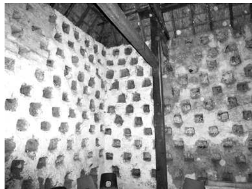
Fig. 11 Trent, Church Farm dovecote

The Dovecote The only surviving cob dovecote in the historic county of Somerset and dating to the 17th-century. Rectangular in plan (26ft 3in long x 23ft 5in wide x 10ft 7in high), it sits on a limestone block plinth under a hipped, thatched roof. A lean-to abuts at the north end. The 550 nest holes, in chequer pattern, occupy 11 tiers on all 4 walls. (Fig. 11)