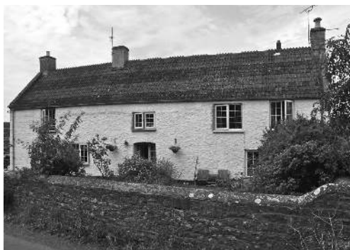
Fig. 15 Winscombe, Laurel Farm

Plan: three rooms in line with two rear wings (late 19th- and mid 20th-century). The random rubble local stone walls, slobbered with white coating, rise to two storeys under a double roman clay tiled roof. Based on the wall thickness, 60cm, and truss construction (ridge piece jointed with a halved joint as has been noted at 3 other properties in the parish) it is suggested that the core is a mid 16th-century two bay, one and a half storey dwelling with a fireplace in the east gable. Mid/late 18th-century a westward extension included a new fireplace on the west gable, with a rounded 'D' shaped internal stack, this replaced that in the rebuilt east gable. About 1800, a further westward extension appears to have been constructed as separate accommodation (own entrance door and inglenook fireplace) but with a similar roof construction to the earlier extension. Later the 2 properties were integrated, the south eaves were raised and a new roof replaced the earlier structure. (Fig. 15)