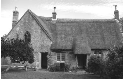
Fig. 2 East Coker. Moor Lane, Chapel Cottage & St. Roche Cottage