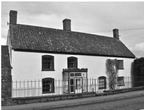
Fig. 18 Winscombe, Myrtle Farm

Plan: L shaped; the main (E-W) range is 2 storeys with attics and the rear (N-S) wing is of 1½ storeys. The 55cm thick walls are rendered and painted. The pan tiled roof, encompassing the original with 50° pitch, is set between coped gables indicating previous thatch. (Fig. 18) Original and very narrow newel stairs serve first floor and attic level; these and a bell system indicating previous servant accommodation. Built