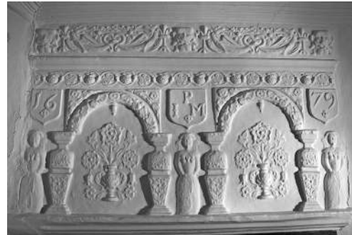
Fig. 9 1679 overmantel, Sherford House

cladding of the walls with brick; raising of the roof (collar-tie-beam trusses) and the formation of attics; installation of larger and taller windows, partitions and 'shell-style' cupboards; beams were plastered, using a Tudor Rose motif in the first floor rooms; the curing chamber was abandoned and a plaster overmantel, dated 1679 (fig. 9), inserted in the kitchen chamber. 18th-century documents indicate that the site contained a tan yard. Tanning processes probably necessitated the erection of 4 other attached 'production' rooms (one has a loft with 2 large brick 'honeycomb' vent-openings in the gable; tanned hides may have been stored here.). A date stone '1789 IW' fronts the two-storey porch. Maps from 1822 indicate a number of other dwellings and non-domestic buildings on site.