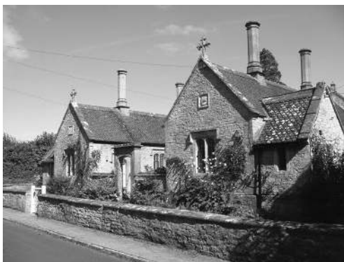
Fig. 14 Trent, Mary Turner's Almshouses

and an apotropaic mark on the lintel); doorway D2 (Ham-stone surround with ogee-step-hollow moulding terminating in a shallow stop). This early plan was hall, opposing doors indicating a crossway, and 2 service rooms divided by a lateral partition, all 2-storey. Late 16th-century the south elevation was re-fenestrated and the walls slightly raised necessitating new roof structure; a new partition defined the cross passage and a stair turret was inserted at the end of it. The hall became the kitchen, with a large baking oven. A gable fireplace was inserted in the former service area to create a parlour. Documents suggest that the property became a farmhouse during the late 18th-century and a 2-storey addition, now gone, built ca 1800 provided a dairy and additional accommodation.