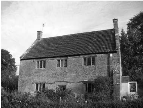
Fig. 13 Trent, The Dairy House

and an apotropaic mark on the lintel); doorway D2 (Ham-stone surround with ogee-step-hollow moulding terminating in a shallow stop). This early plan was hall, opposing doors indicating a crossway, and 2 service rooms divided by a lateral partition, all 2-storey. Late 16th-century the south elevation was re-fenestrated and the walls slightly raised necessitating new roof structure; a new partition defined the cross passage and a stair turret was inserted at the end of it. The hall became the kitchen, with a large baking oven. A gable fireplace was inserted in the former service area to create a parlour. Documents suggest that the property became a farmhouse during the late 18th-century and a 2-storey addition, now gone, built ca 1800 provided a dairy and additional accommodation.