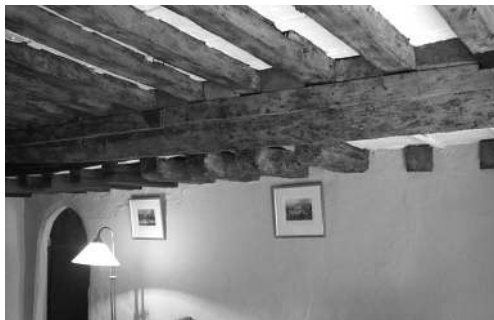
Fig. 20 Winscombe, Hale Farm jetty

the western most room which is two-storey with a cellar beneath. All elevations are painted random rubble masonry and the largely modern rafter roof, previously thatched, is clad with double-roman clay tiles. The house is set into the hillside to the north-east and the ground falls away to the west. D. Williams & F. Neale (survey 1988) suggested a possible 'longhouse', whilst not entirely negating this we think it unlikely. The oldest part of this building survives to the east of the cross passage. We suggest it was a two-unit open hall house built in the latter half of the 15th-century based on the wall thicknesses (those of the hall and inner room 65 & 76cm, some with a batter), two doors with two-centred heads and 8cm chamfers and the jettied solar chamber (fig. 20), accessed by stairs