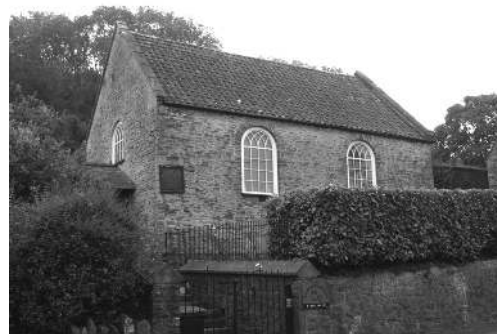
Fig. 17 Winscombe, Old Wesleyan Chapel

This building was originally a simple one-room plan and was built in 1798 on land recovered from “the waste”. Within the space there is a gallery that may formerly have been accessed by way of an outside stair. The tall round-headed windows with divided glazing bars are distinctive. (Fig. 17) The roof is constructed over three elm collar trusses, the collars being fixed with profiled half-dovetail joints. There are two tiers of purlins and the long tenon joint is rare in so far as the purlins are not off-set but