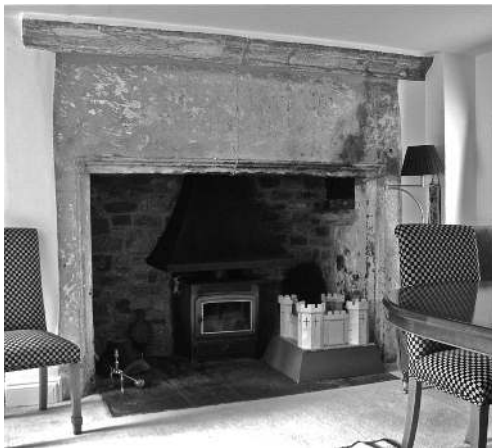
Fig. 16 Winscombe, Wellage Cottage Court

Plan: four rooms in line rising to one and a half storeys with a single storey addition. The walls, 50–70cm thick, are rendered and painted under a pan-tiled roof with a common ridge height but two different eaves levels. The open hall core of the house dates from around 1500; based on smoke blackening, truss construction, 3cm chamfers on the purlins and remnants of wind bracing. A closed (wattle & daub) truss indicates a solar over an inner room. Mid 16th-century fireplaces were inserted in the hall and inner room (fig. 16) and the ground floor was ceiled.