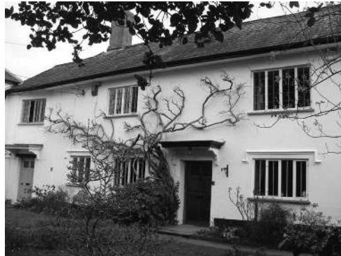
Fig. 5 Lydeard St. Lawrence, Manor House

Plan: two rooms (kitchen/living room & parlour) divided by a central passage and rising to two storeys. To the rear are two wings (the NW may be part of the original build) with an enclosed passage way between them. The early phases of development are uncertain; wall thickness, a concave chamfered beam, two of the fireplaces (F1 cambered bressumer with hollow-step-ogee chamfer, anvil stop on the orthostatic jamb, F2 5 cm chamfer & run out stops to the bressumer and pyramid stops to the orthostatic jambs) plus hood moulds over the mullion windows suggest the early 17th-century. (Fig. 5) Similarity of