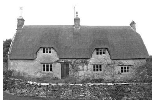
Fig. 3 Longburton (Dorset), Spring House

Plan: three-rooms in-line and one-and-a-half storeys with a 2-storey north wing. (Fig. 3) The rubble-stone (Forest Marble) walls have an internal inward-sloping batter. The thatched roof is supported by three long-tenoned side-pegged jointed-cruck trusses. The principals are joined by cambered collars with a straight-cut mortice-and-tenon apex joint. Curved wind-braces sit between the lower and upper purlins. All joints are wood pegged. A 15th-century date of build is suggested; smoke blackening and