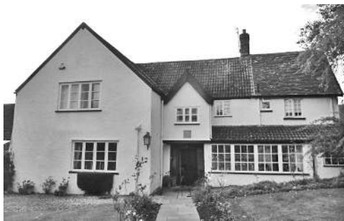
Fig. 8 Taunton, Sherford House

Plan: two-storey, with two original ground floor rooms and additions on three sides. The walls are roughcast and brick clad, over cob on the south front. (Fig. 8) A date of build ca. 1600 is suggested. Then it was one-and-a-half storey, comprising kitchen and hall with a central dividing partition. The kitchen fireplace, curing chamber and winding stairs were extant. Substantial gentrification occurred in the late 17th-century; raising and