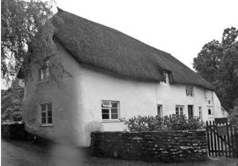
Fig. 21 Wootton Courtenay, Bridge Cottage

rendered over rubble stone and cob), 8 cm deep chamfers with cyma-stops on beams, remnants of jointed-cruck trusses. In the mid 19th-century it functioned as an Inn. (Fig. 21)