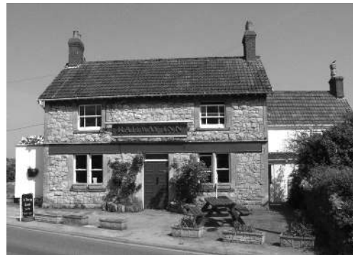
Fig. 19 Winscombe, The Railway Inn

Plan: a two storey north range and single storey lean-to rear wing, possibly a scullery, is the prime focus of our survey. Dating from late 18th-century it comprises parlour, central stair entry, and kitchen/living room. The random rubble construction walls, 55cm thick, are rendered and painted. The roof, supported on three principal trusses (feet visible in the rooms below), with cut-back and tusk-tenoned purlins is clad in double roman clay tiles. The railway opened in 1869; lodging and beer provision was necessary for constructors and passengers. The present frontage was added in the early 20th century. (Fig. 19)